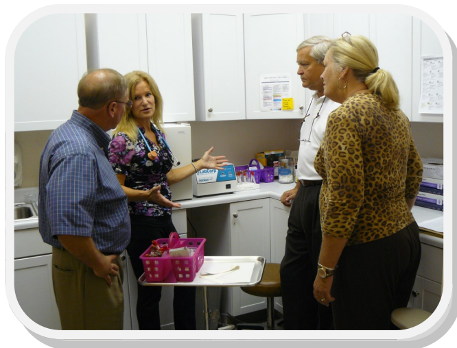
The Community Care Clinic of Dare received a Community Foundation grant of $13,221 in 2012 to provide enhanced services for diabetics with emphasis on prevention and management.