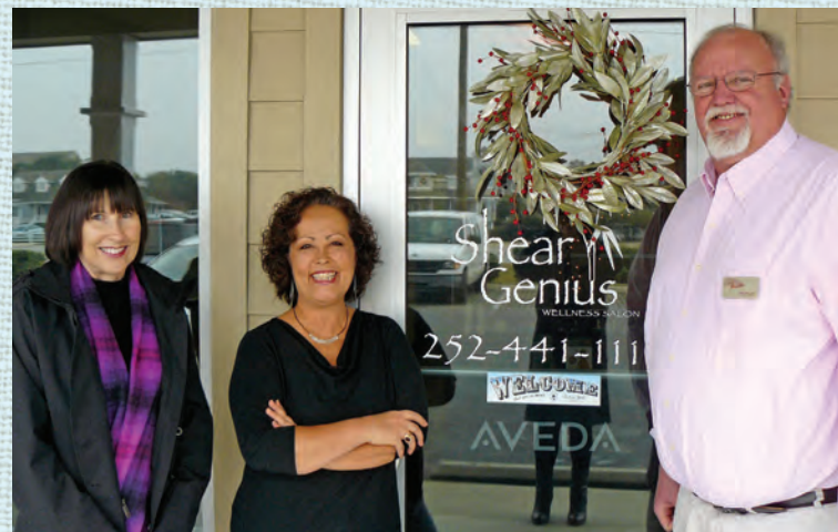
Local businesses Shear Genius and Village Realty established new scholarship funds in 2013.