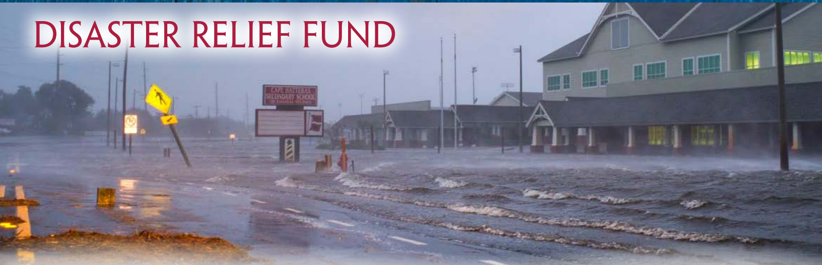
Those are waves breaking in the parking lot of Cape Hatteras Secondary School.

It was before daylight on Sunday, October 9, 2016. An 87-year-old waterman from Hatteras Island was standing with his cat in cold, waist-deep water in his house when he heard banging on his door. It was his neighbor on a surfboard, coming to rescue him from the flood. The neighbor found a skiff, and after nearly being swept into the sound, they made their way to Highway 12, where they were picked up in a high-wheeler and taken to shelter.