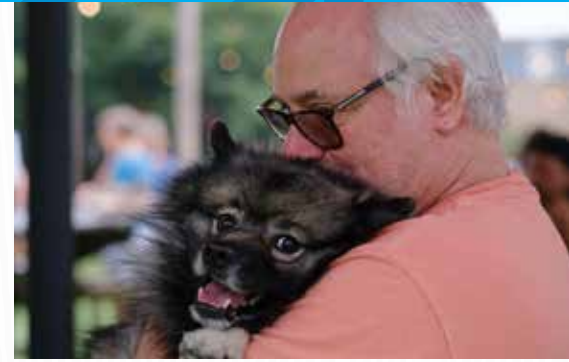
Coastal Humane Society's Project "Help A Dog's Heart" is continuing to prevent heartworm disease and save pet's lives.

A Tribute to the Legendary Ladies of Soul $9,500