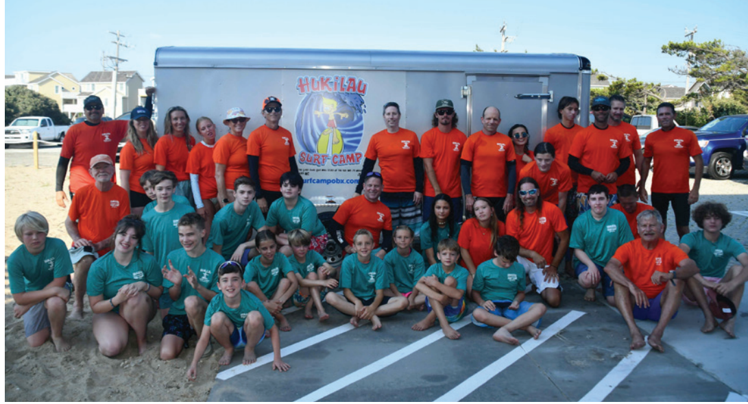
Left: Hukilau Surf Camp has been teaching kids to surf for almost 25 years. Above: Hukilau Surf Camp Students & Instructors in front of the new trailer in the summer of 2024.