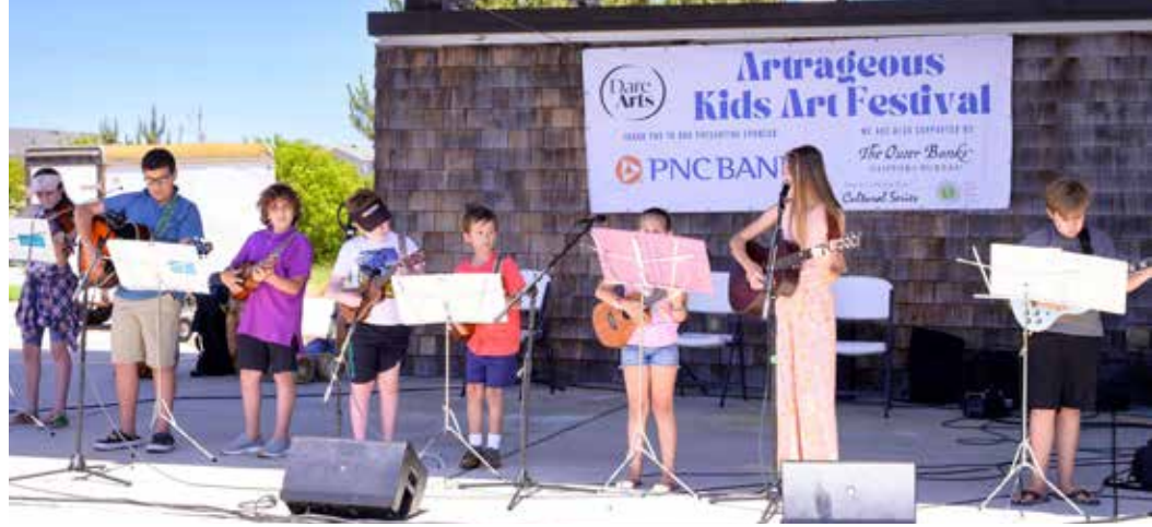
Hatteras Island Community Strings perform at Artrageous 2025.

New Wrestling Mats for Manteo High School