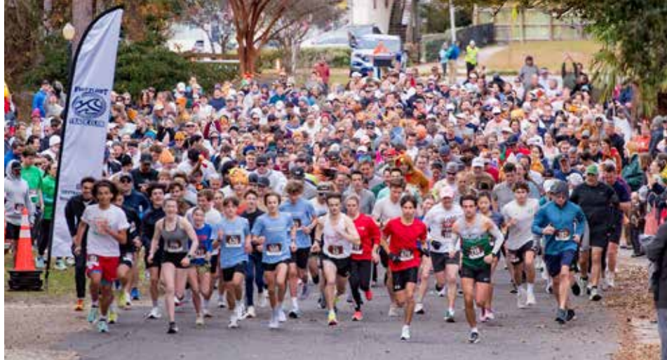
The Duck Turkey Trot 5K.

THANKSGIVING DAY IS THE MOST POPULAR RUNNING DAY IN THE UNITED STATES , with Turkey Trot races taking place all over the country, and this tradition holds true on the Outer Banks, too.