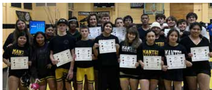
Through a Community Enrichment Grant, Manteo High School will purchase new, modern mats that will not only improve safety for wrestlers in grades 2 through 12 but also transform the space into a true multi-purpose athletic room.