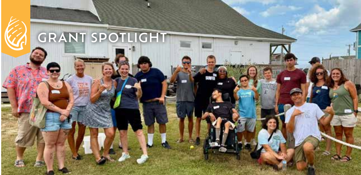
A Surfing For Autism Sandbar Social event at Surfin' Spoon.