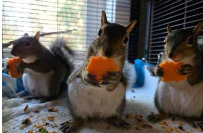
Dare Wildlife Rehab, led by founder Dana Roepcke, provides care and rehabilitation to orphaned, ill, or injured wildlife with the goal of release. The organization has received grants from multiple Community Foundation funds dedicated to animal welfare.